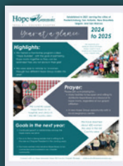
TEXAS HILL COUNTRY